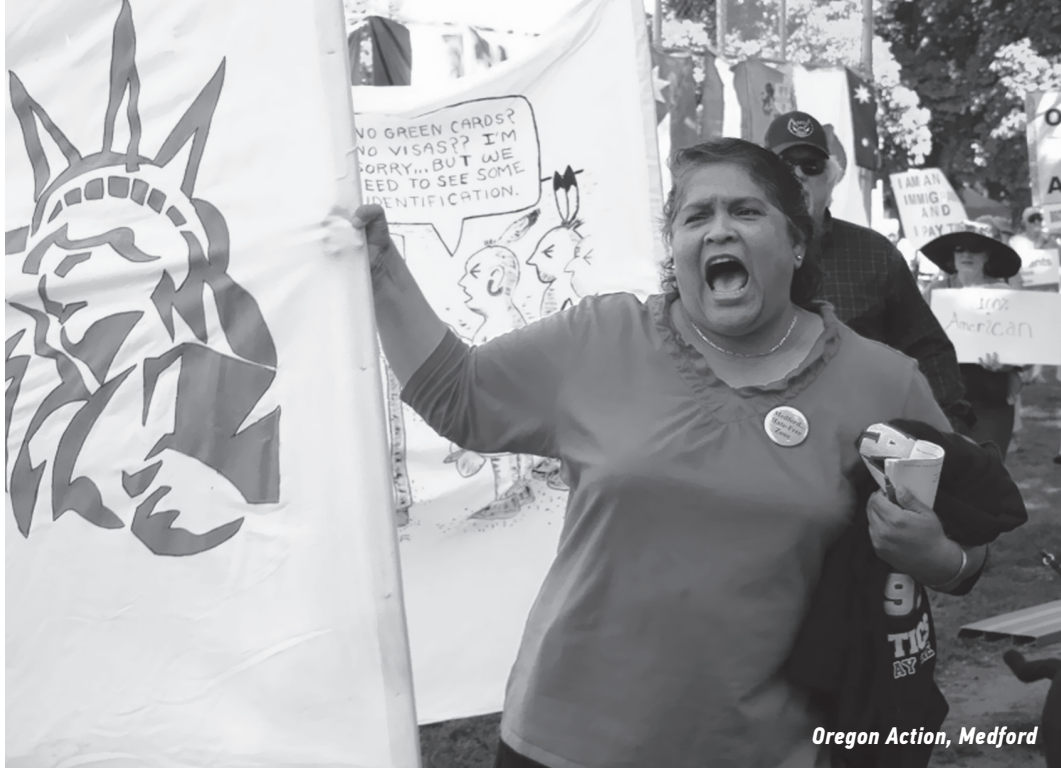
Oregon Action, Medford