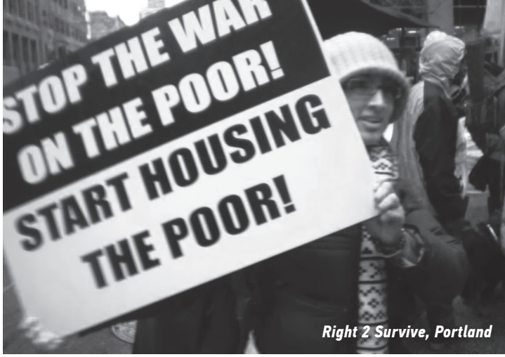
Right 2 Survive, Portland