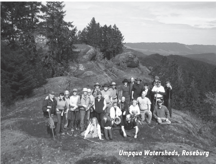
Umpqua Watersheds, Roseburg

Beyond Toxics Eugene Cascadia Wildlands Eugene Crag Law Center Portland Umpqua Watersheds Roseburg